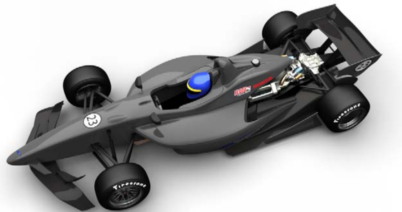
Swift Engineering Inc. © 2010