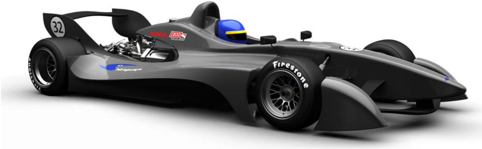
Swift Engineering Inc. © 2010