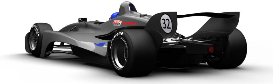
Swift Engineering Inc. © 2010