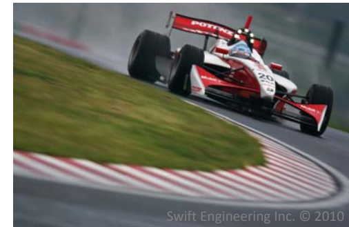
Swift Engineering Inc. © 2010