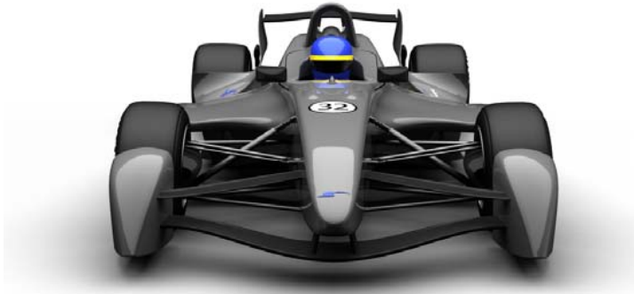
Swift Engineering Inc. © 2010