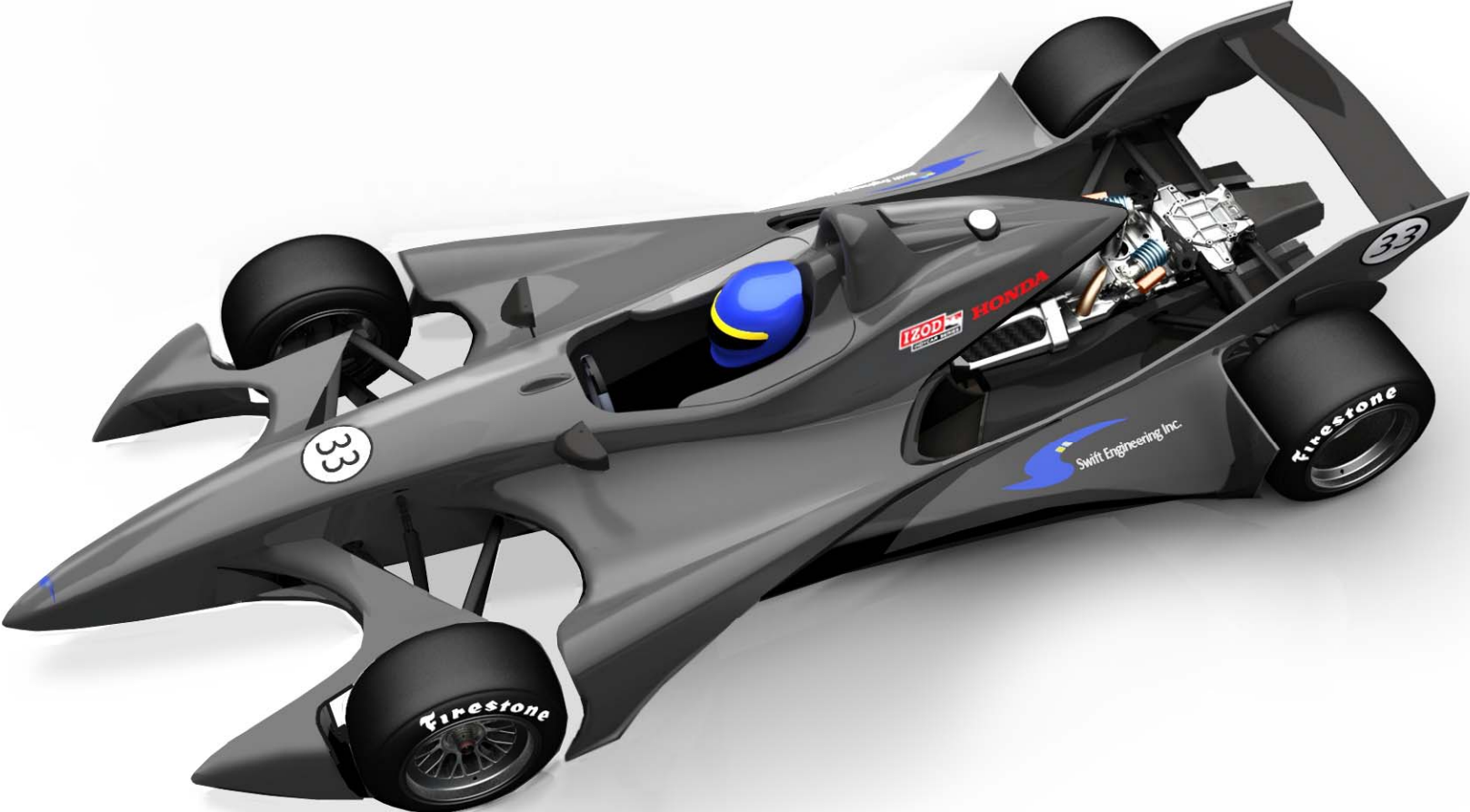
CONCEPT INDYCAR #33 – a variation of IndyCar concept #32