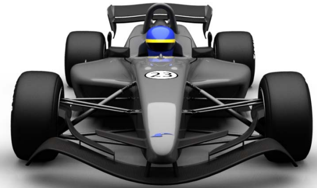
Swift Engineering Inc. © 2010