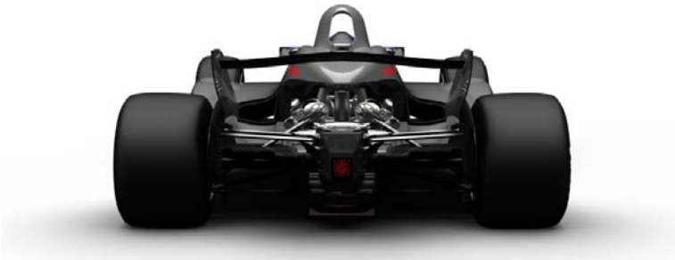
Swift Engineering Inc. © 2010