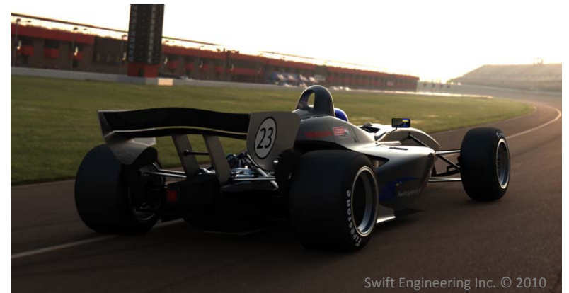
Swift Engineering Inc. © 2010