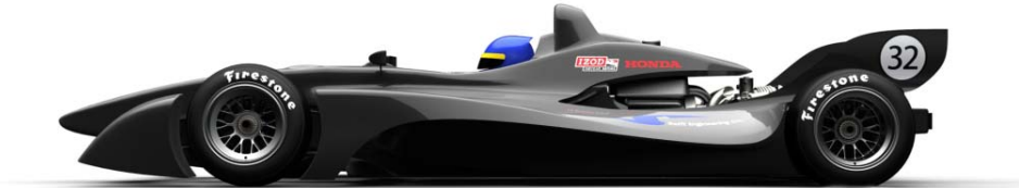
Swift Engineering Inc. © 2010